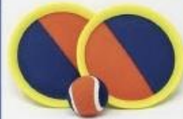
Toss & Stick