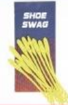
Neon Shoe Swag