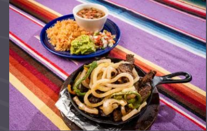
Lunch from Kiko's