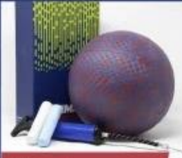
Ultimate Four Square Kit