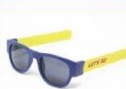
Roll Up Sunglasses