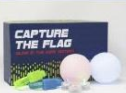
Capture the Flag *Glow in the Dark Edition