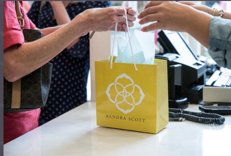
Kendra Scott Earrings