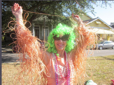
Silly String Party