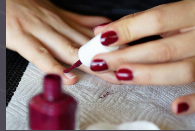
Manicure or Pedicure