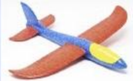
High Flyin' Glider