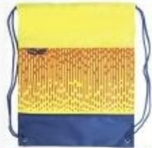
All Sports Gym Bag