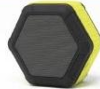
Hexaboom Wireless Speaker